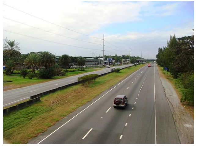
A highway near Manila. (Overview from Bridge (NLEX, Sta. Rita))