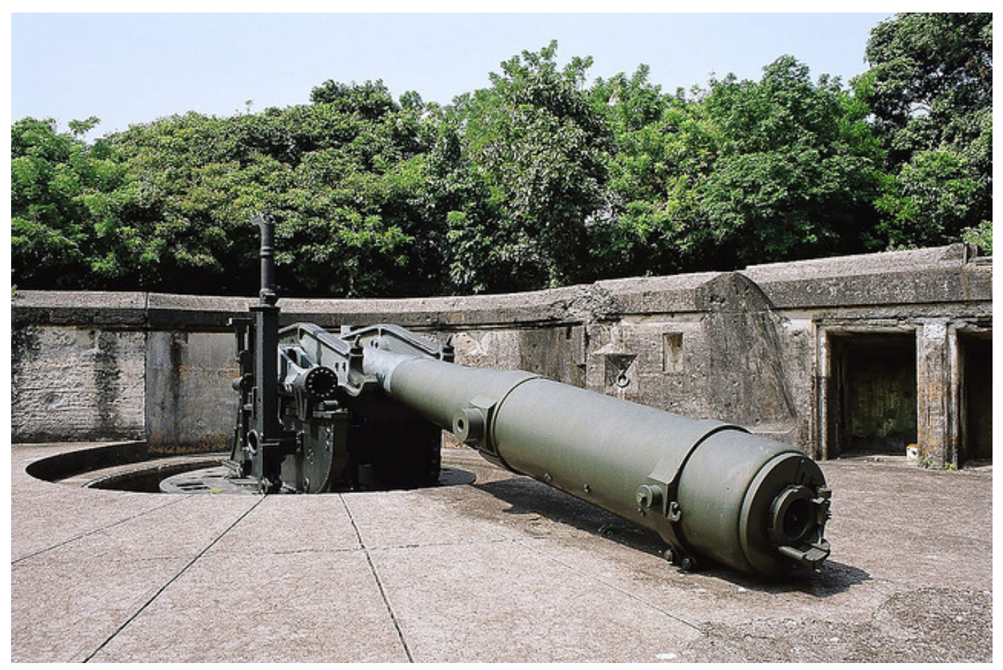
A World-War-II cannon rusts on Corregidor Island.

In 1935 Manuel Quezon was elected president of a commonwealth government designed to prepare the country for independence after a 10-year transition period. World War II intervened, and in May 1942, Corregidor, the last American stronghold, fell. U.S. forces in the Philippines surrendered to the Japanese, who occupied the islands until 1945.