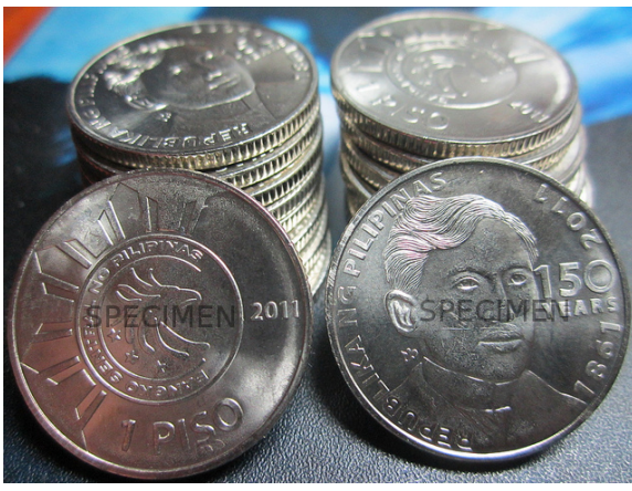
New Philippine Peso (Php 1.00) Coin

Most major credit cards are accepted. Commercial banks offer the highest rates for traveler's checks. Many hotels, restaurants and shops also cash traveler's checks but at lower rates.