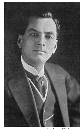
Author: Unknown Date: Unknown Public Domain

Author: unknown Date: 1898 Public Domain