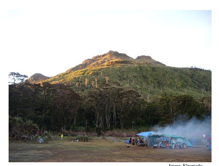
Mt. Apo, Davao, Mindanao

The terrain offers great contrasts. On the larger islands, the narrow coastal lowlands rise into mountain ranges and peaks. The highest, Mount Apo (9,600 ft.), is in Mindanao. The fertile, rice-producing plain in Luzon is the most important agricultural area in the country. Dense jungles in the interior and rich sugar fields along the coast characterize the Visayan islands. Twelve volcanoes are active, and a number erupt periodically. The islands are subject to occasional earthquakes violent enough to cause substantial material damage and loss of life.