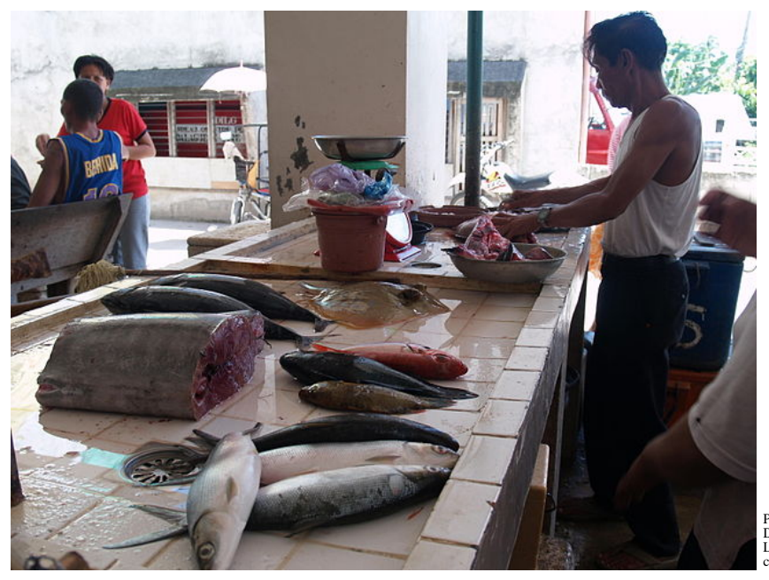
Photo: flypegassus Date: 9 Feb 2007 Location: Dalaguete, Cebu Philippines cc-by-2 0

Water in Manila and a few other designated areas is safe for drinking. Outside these locations boil or chemically treat public water. Also, take precautions before eating produce: peel, soak, scrub or cook fruit and vegetables and make sure that fish and meat purchased in local markets is fresh.